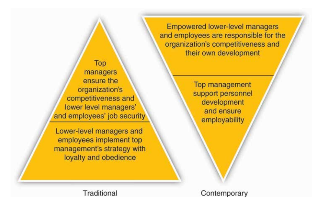
Figure 1.4 The Changing Roles of Management and Managers