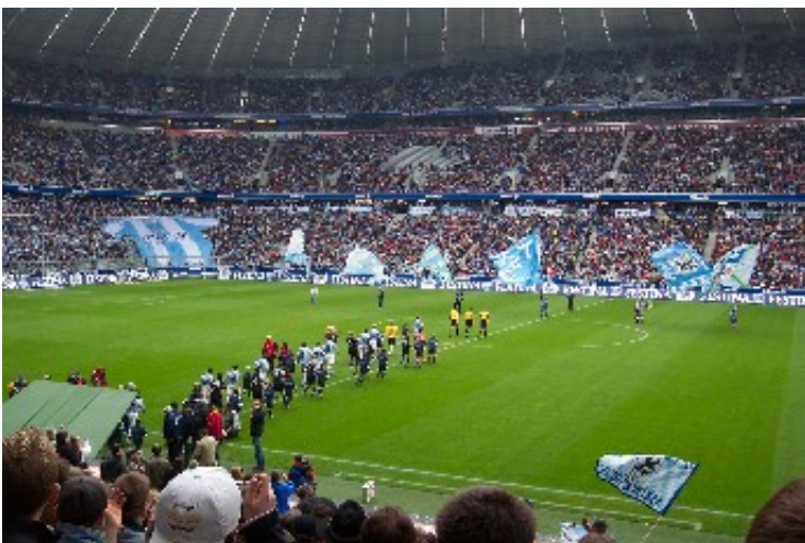
Loewentreue! Stark wie noch nie! attendance)