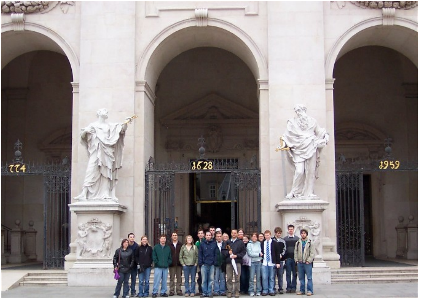
In front of the Salzburg Cathedral. What do those numbers mean?