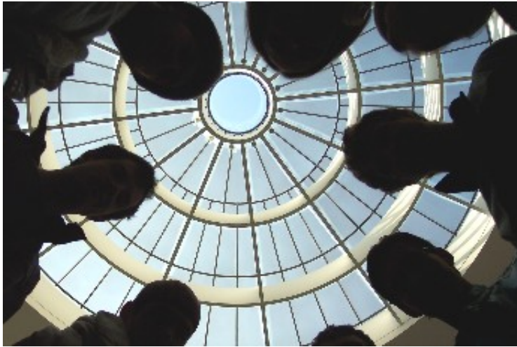
On the train.