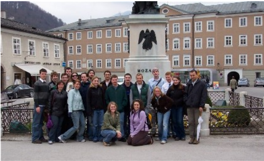
A quiz! Mozart balls (not pictured).