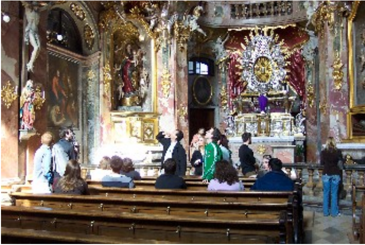
Asamkirche. Asam church.