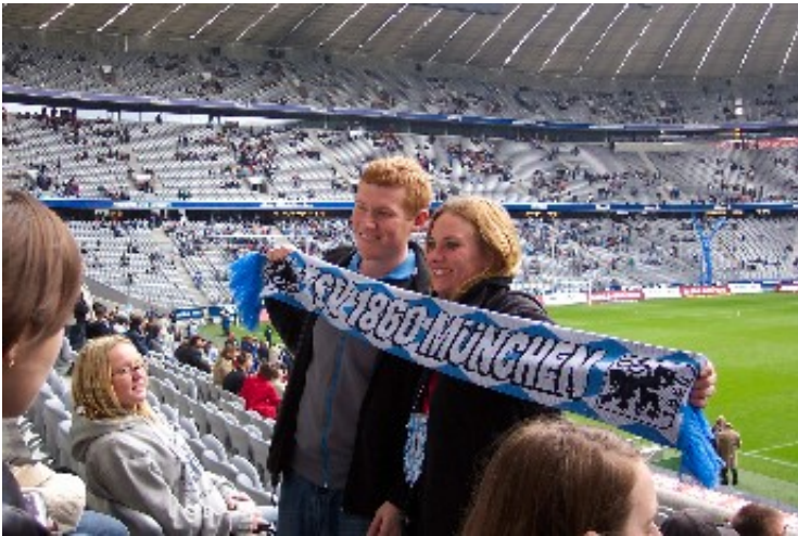
The Allianz Arena