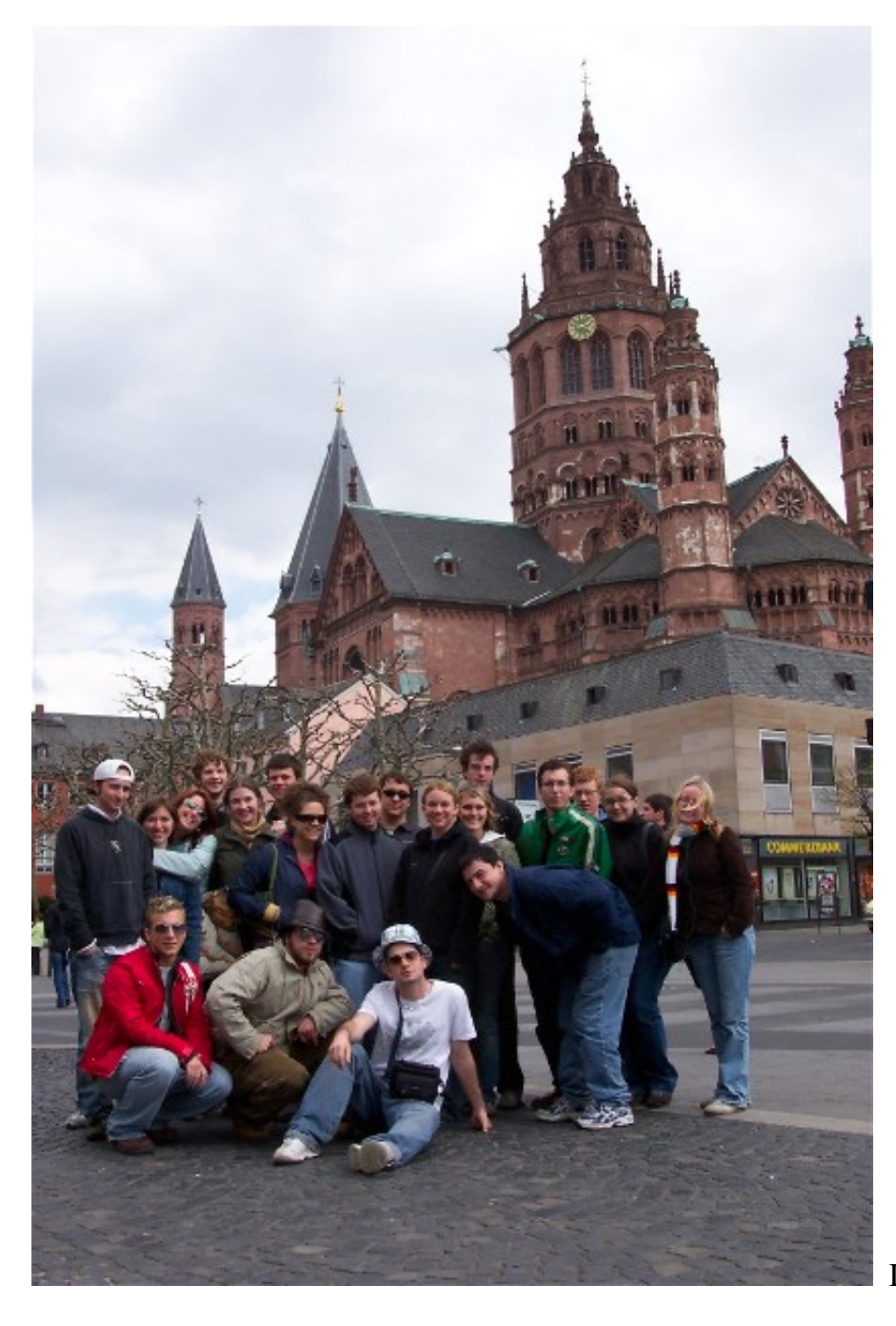
In front of the Mainz Cathedral