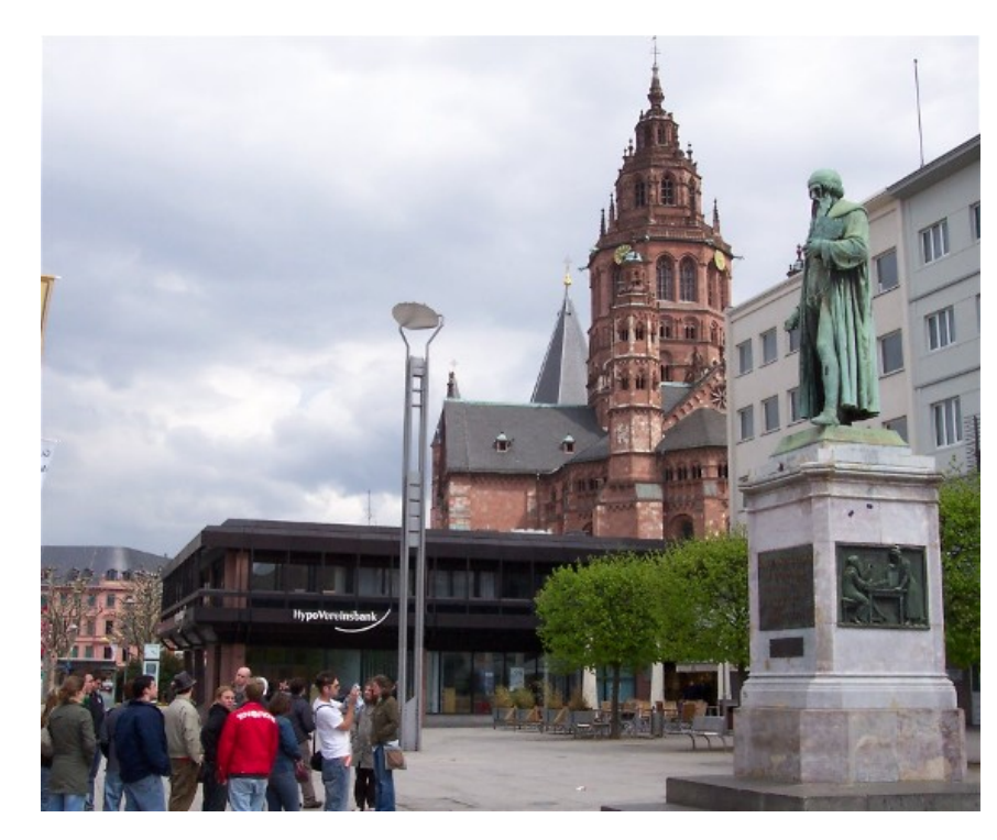
OU meets THE person of the 20th century