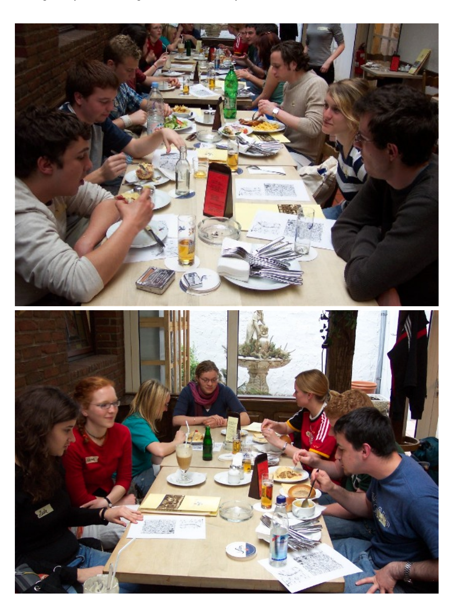
Friday: A visit to the Koenigin Luise Schule