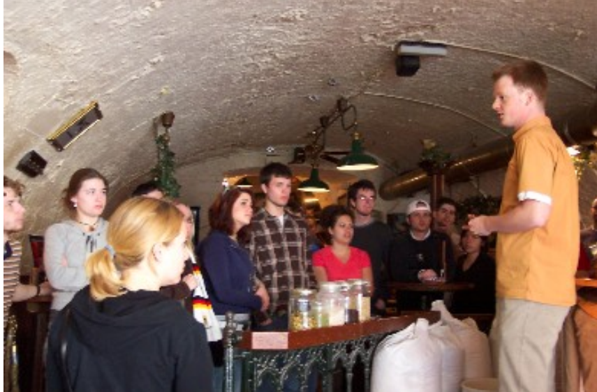
On the Rhine River