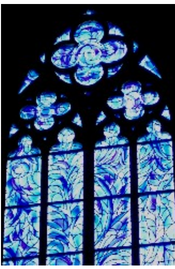
Church Windows by Marc Chagall