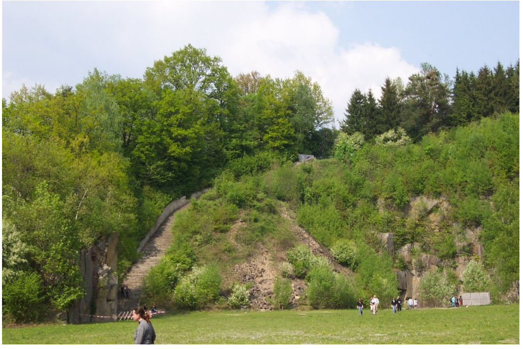
Todesstiege. "Steps of Death" (Like many concentration camps, Mauthausen is located next to a quarry. Inhaftees were forced to work there, where many soon died under brutal conditions)