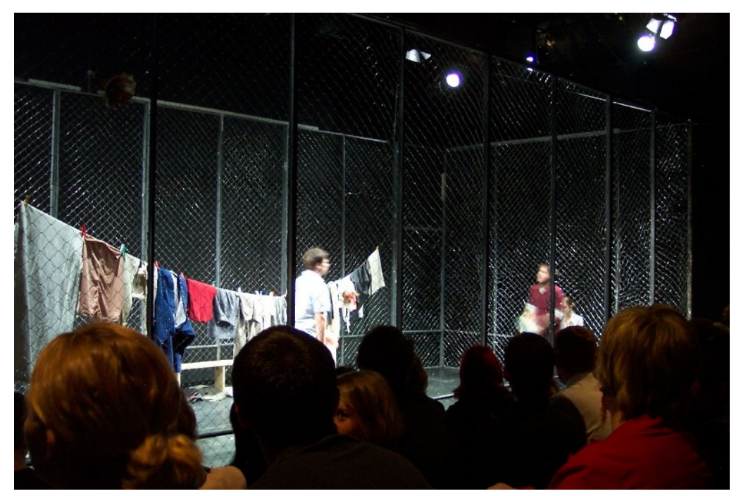
Thursday: In the theater