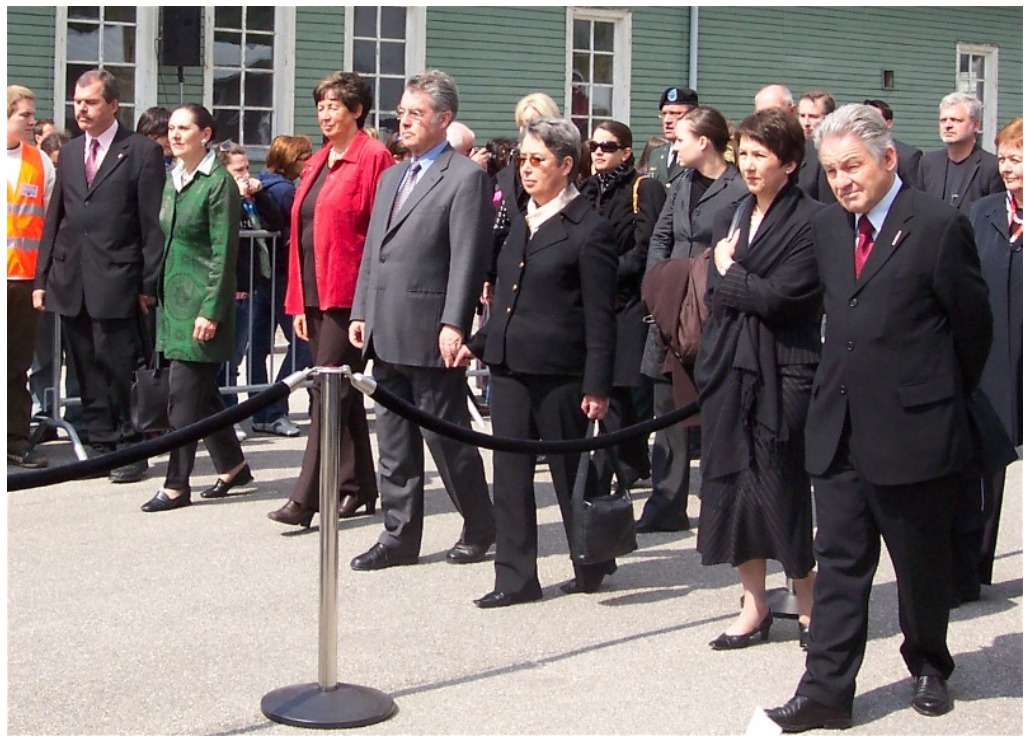
The President of Austria (grey suit) and the Governor of Upper Austria (right, black suit)