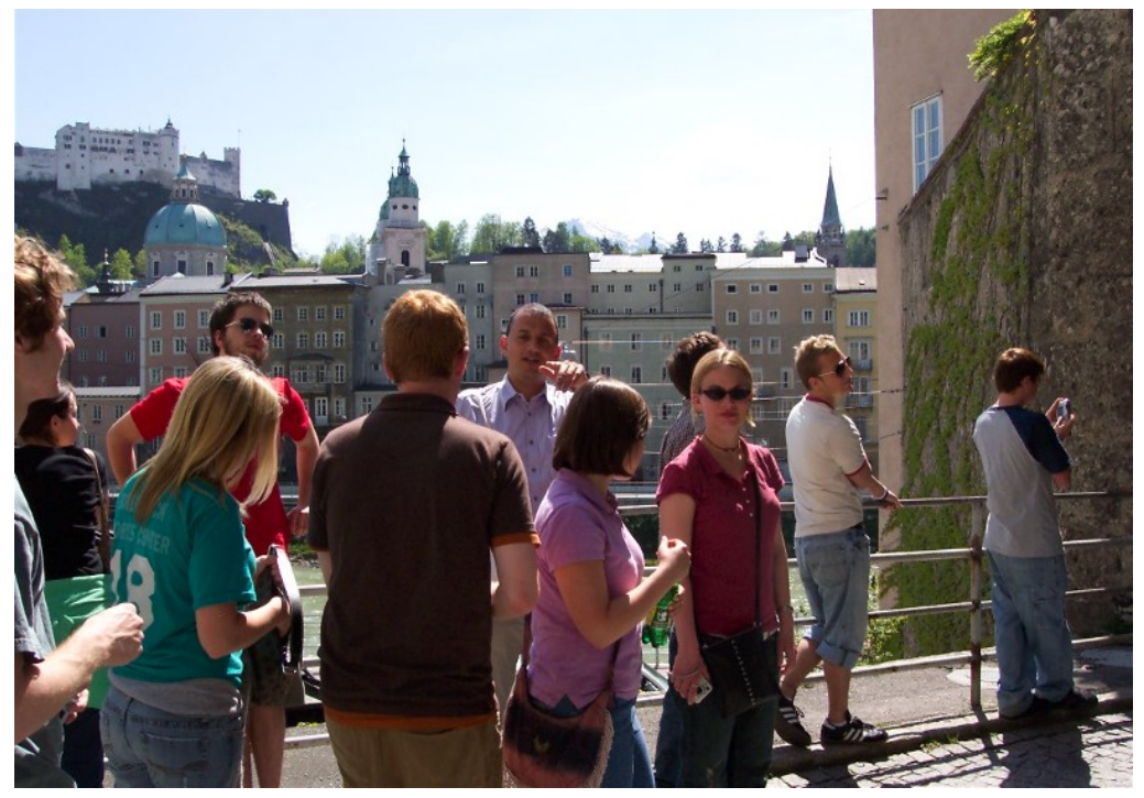
In the Steingasse