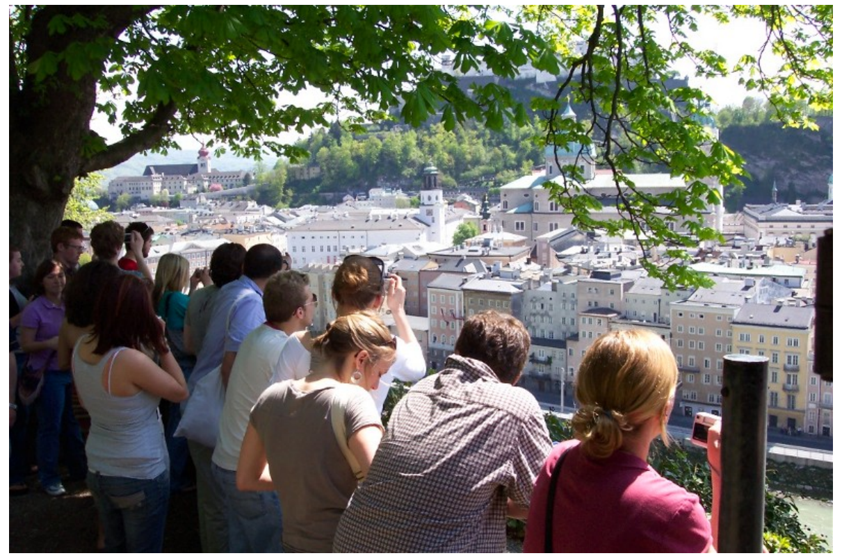
A view of the city from the Kapuzinerberg