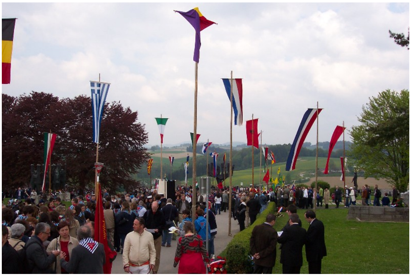
Sunday: Trip to Mauthausen. Site of former Concentration Camp. This was the annual Liberation Day Memorial, marking the camp's liberation in 1945. There were diplomats and representatives from all countries that had citizens imprisoned here during the National Socialist era.