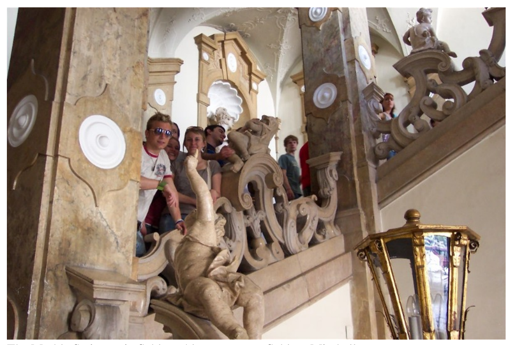
The Marble Staircase in Schloss Altenau - oops, Schloss Mirabell