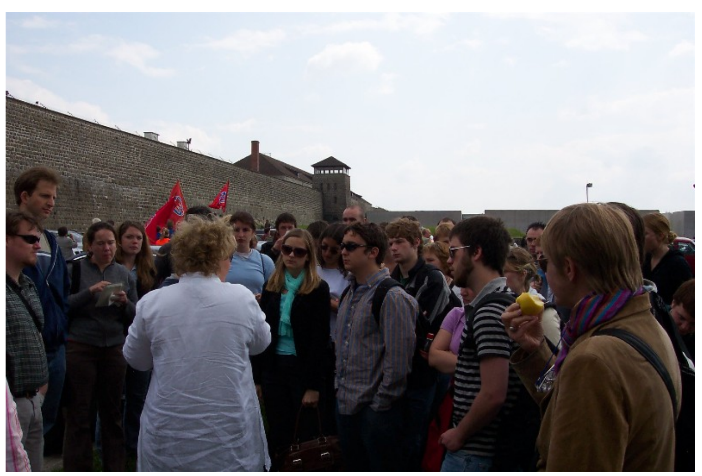
A tour of the camp led by a historian working with BGSU