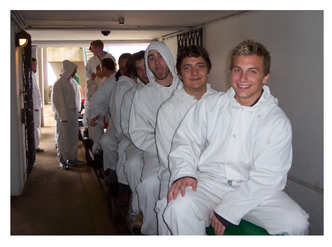
To reach the mine inside the mountain, one must first ride a train inside the mountain.