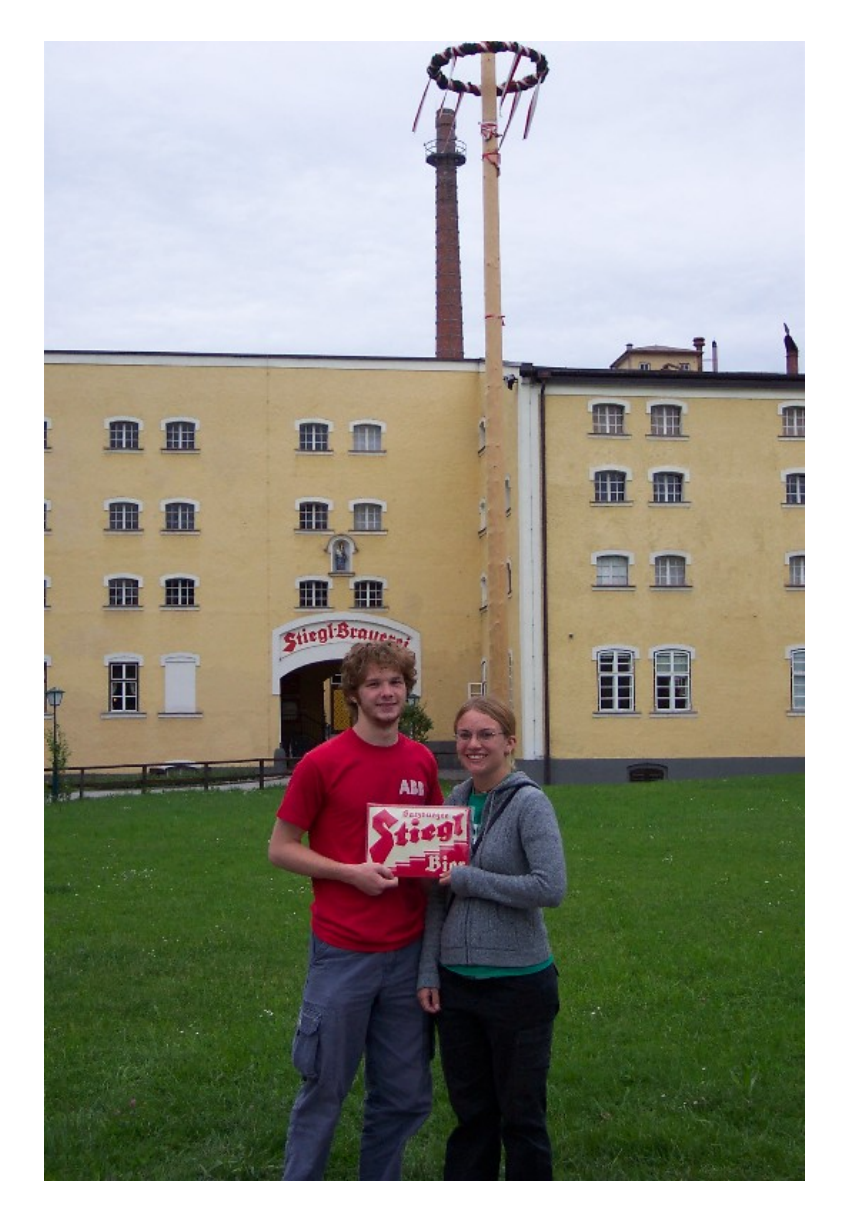
Wednesday: Excursion to the <u>Salt Mines in Hallein/Duernnberg</u> Students had to wear protective clothing for the mines.