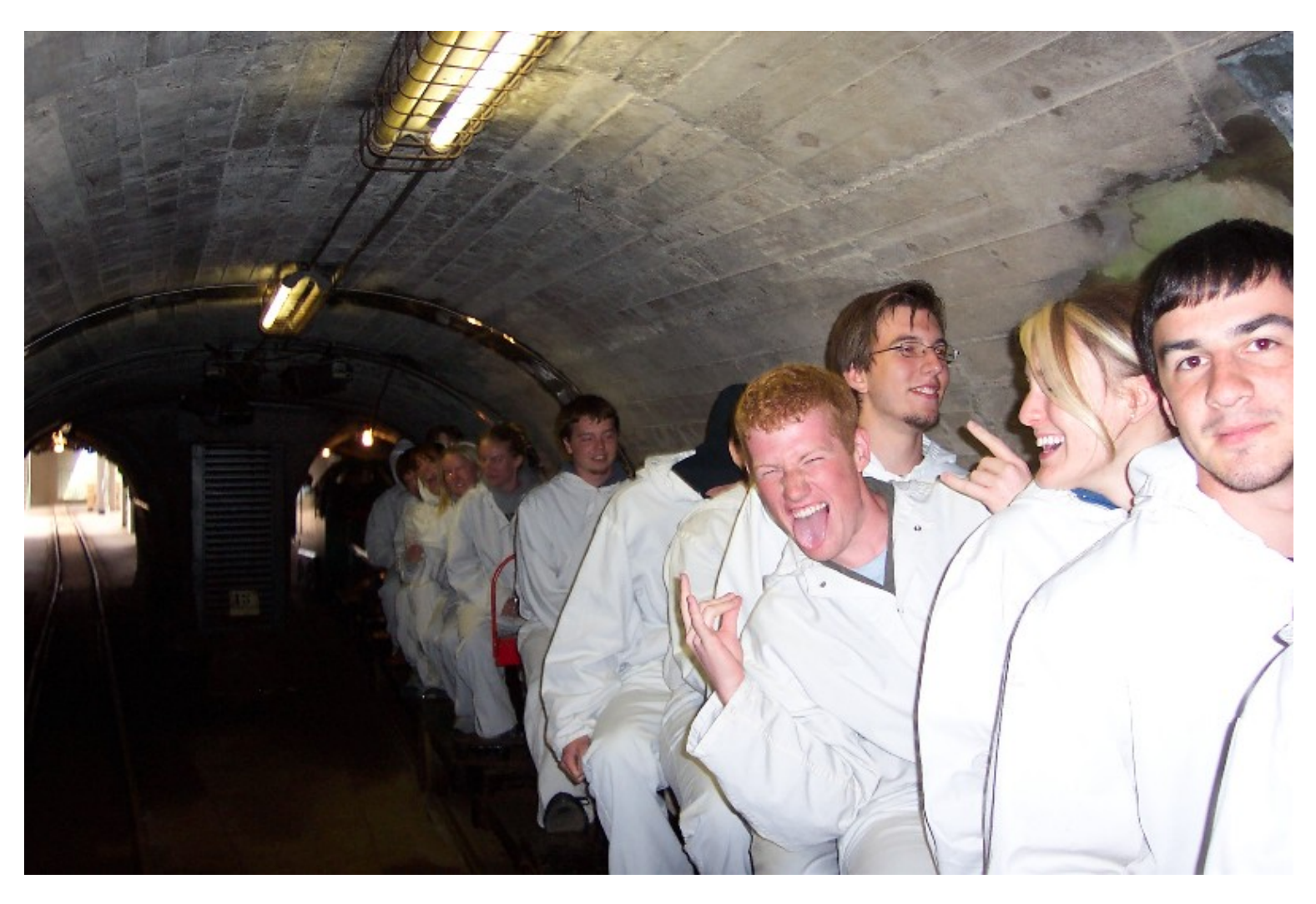
To reach the lower levels of the mine, one must ride the slide.