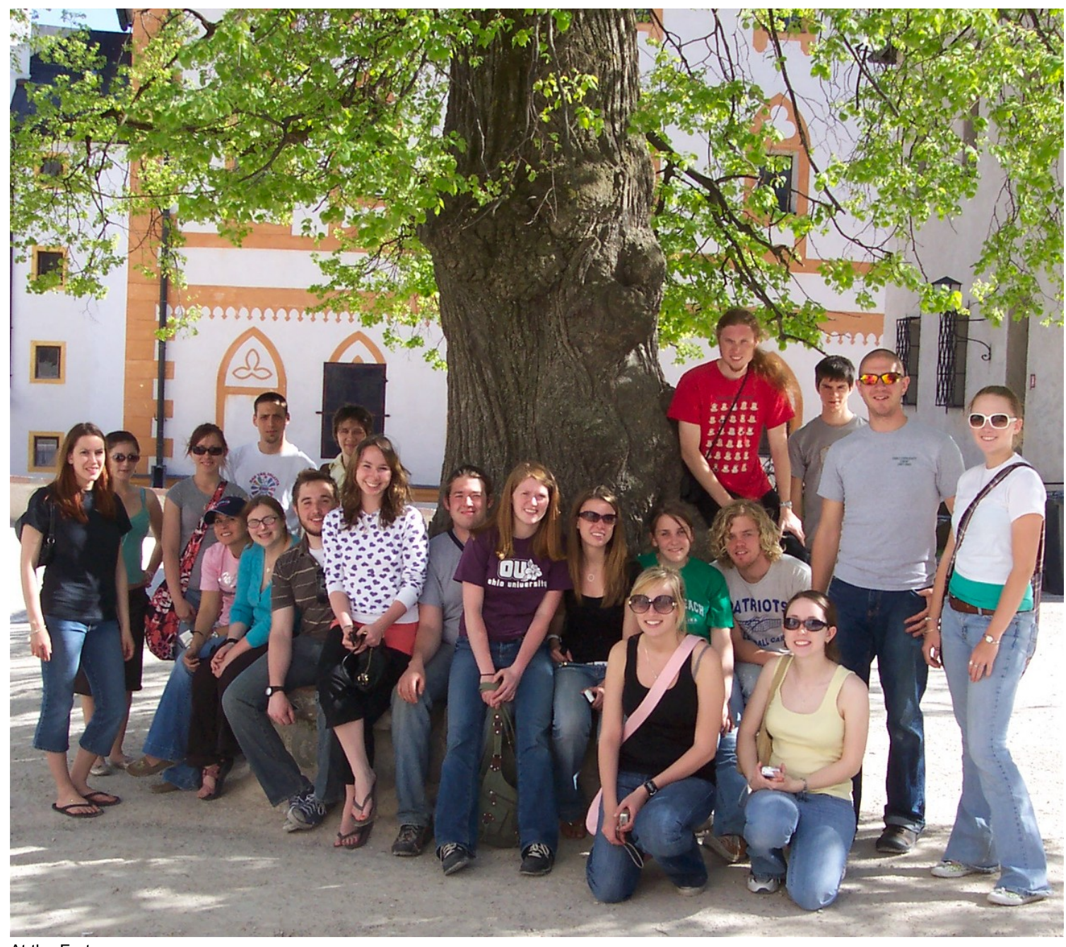
At the Fortress