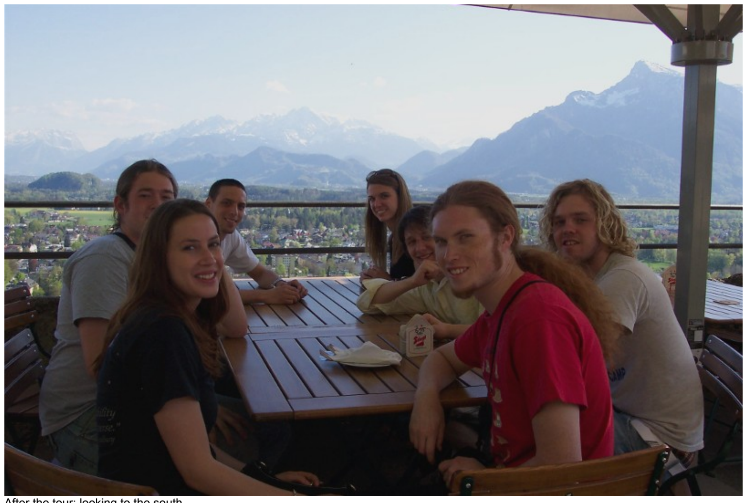
After the tour: looking to the south