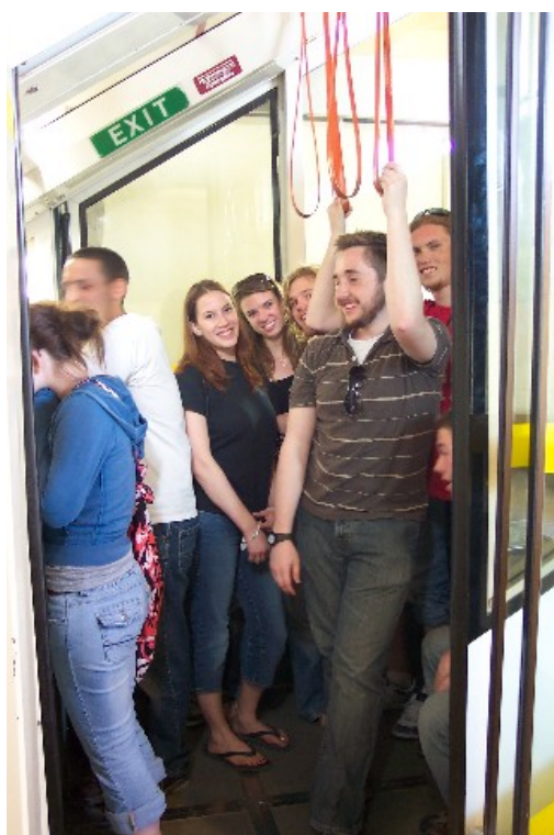
Taking the funicular down into town