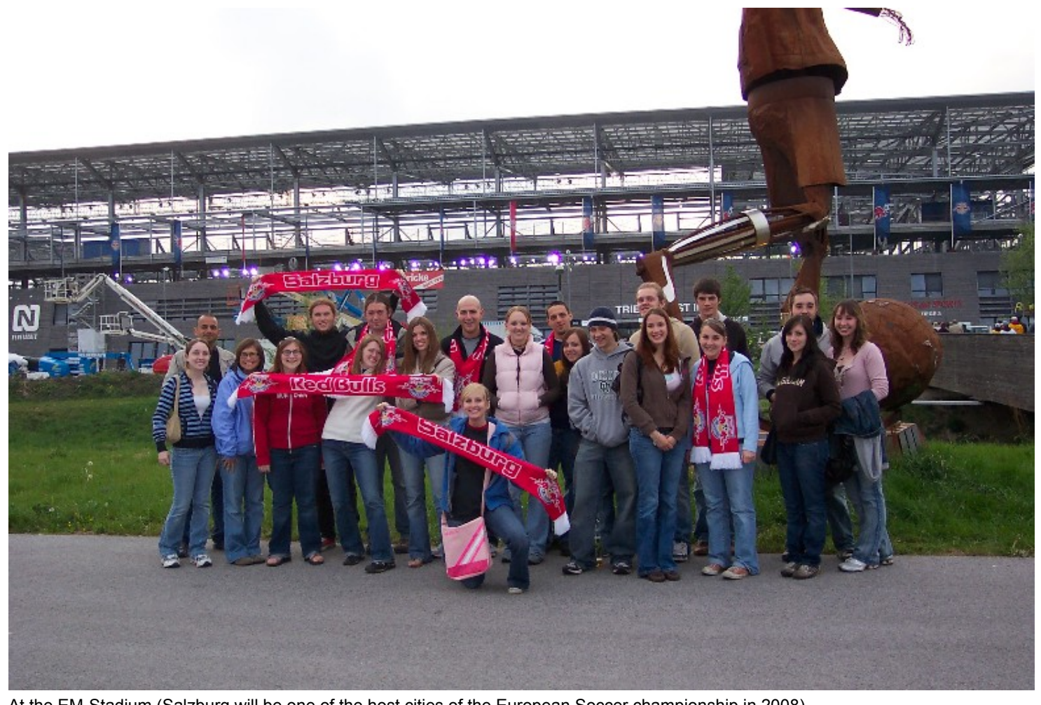
At the EM-Stadium (Salzburg will be one of the host cities of the European Soccer championship in 2008)