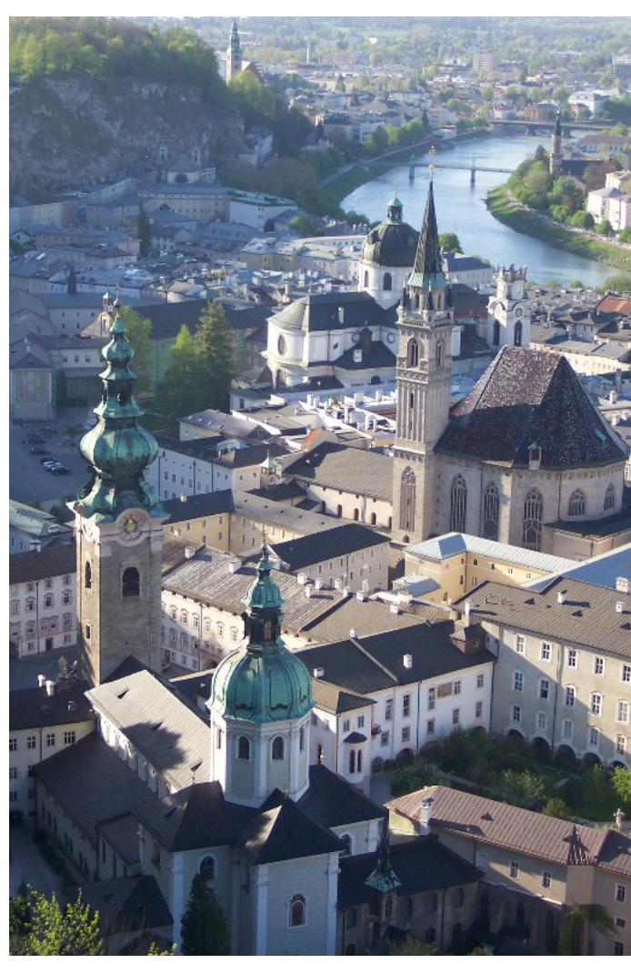
View from the top of the Festung