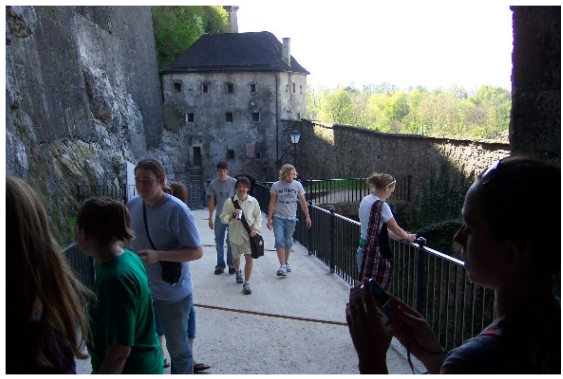
Walking to the Fortress (without armor)