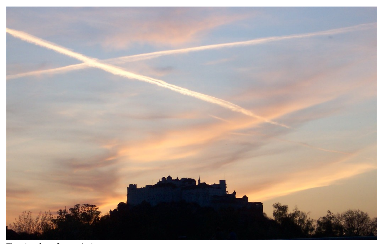
The view from Stammtisch