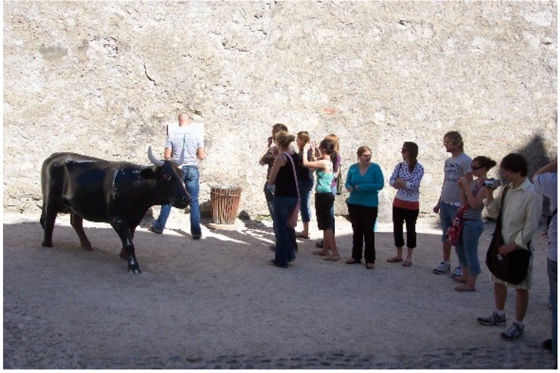
Stierwaescher (wouldn't red be more appropriate? see below)