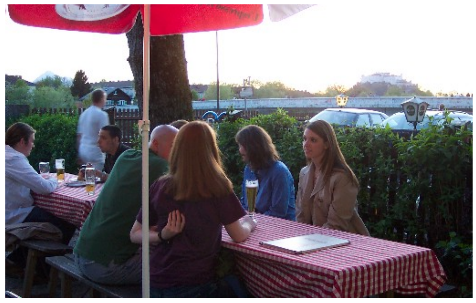
Stammtisch at Gasthof Ueberfuhr

Wednesday: Soccer game (Salzburg Red Bulls vs. Josko Fenster Ried)