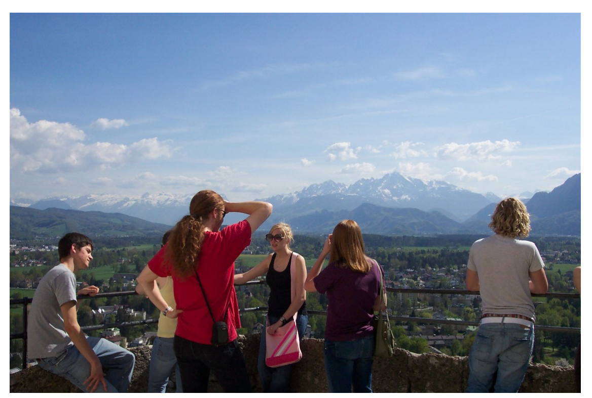
View from the south side of the Fortress