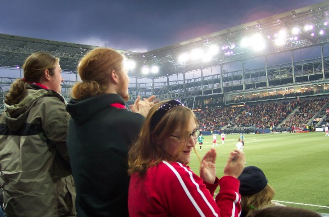
First goal for Salzburg!