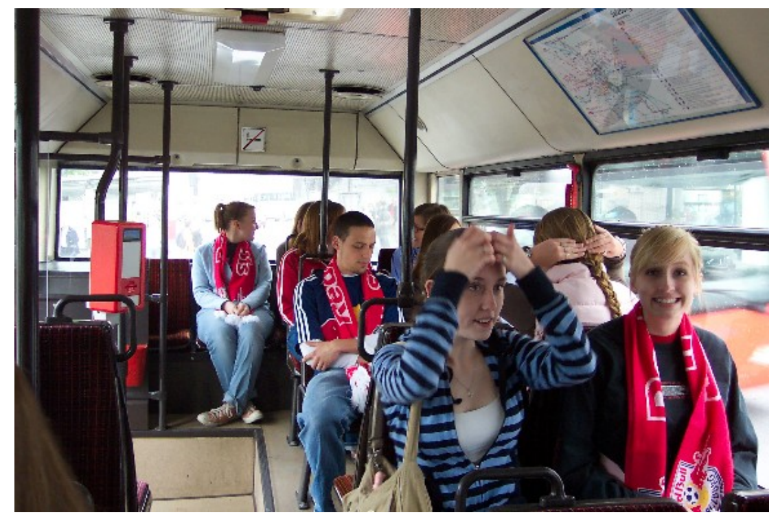
In the bus on the way to the EM-Stadium

Wednesday: Soccer game (Salzburg Red Bulls vs. Josko Fenster Ried)