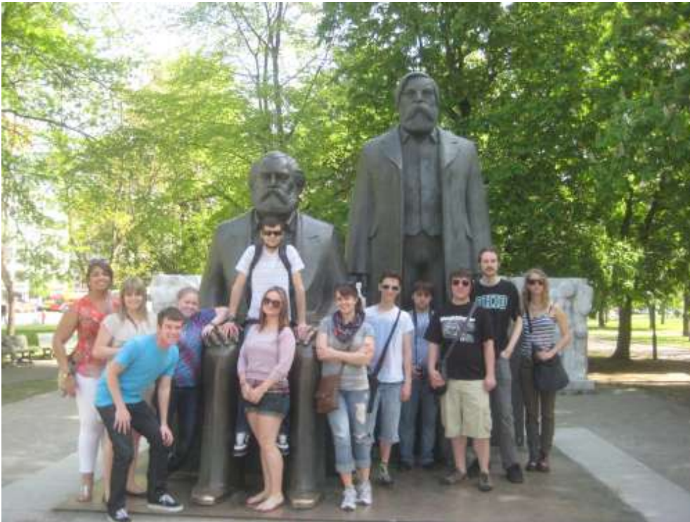
Marx and Engels