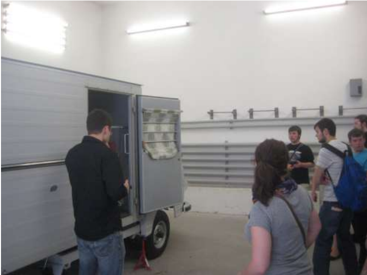
A tour of the former STASI prison in Berlin-Hohenschonhausen