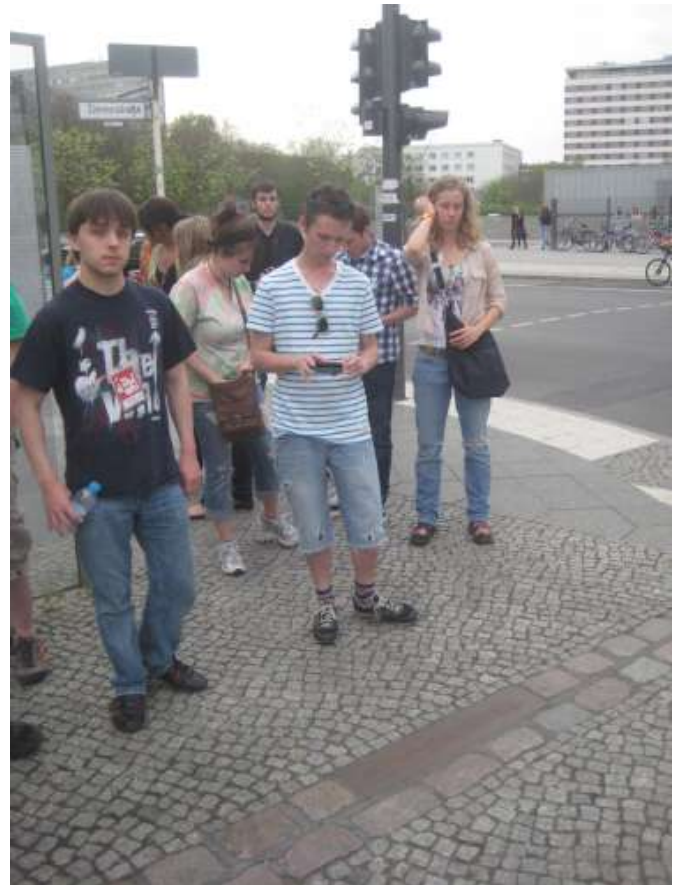
At (what once was) the Berlin Wall