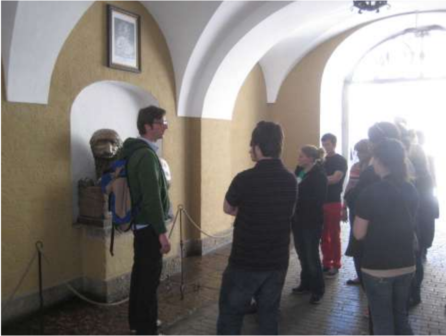
A lion that once was in the Cathedral