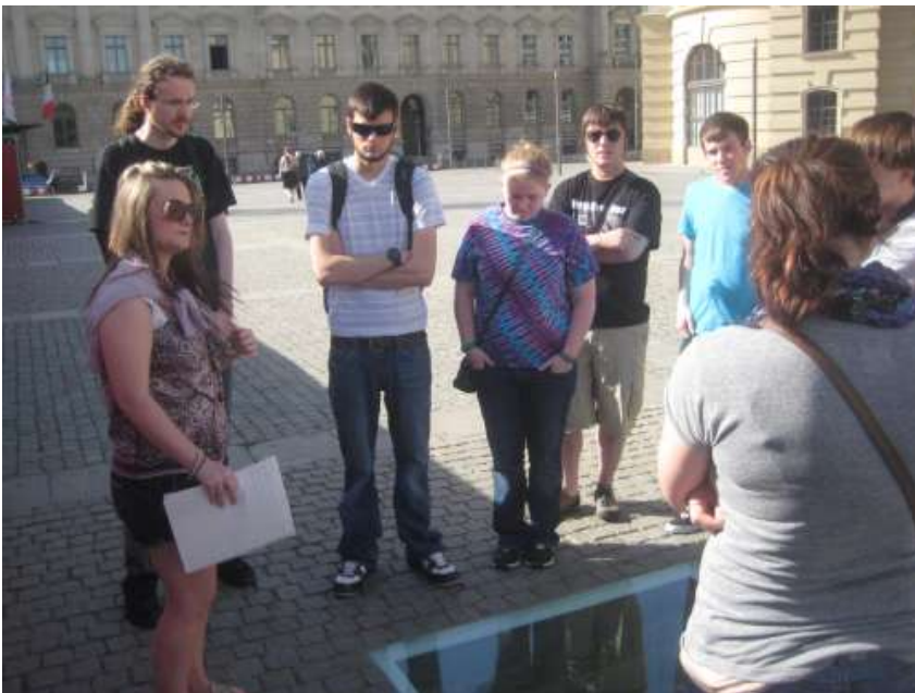
Monument to the book burnings