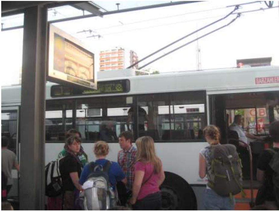
Back in Salzburg!