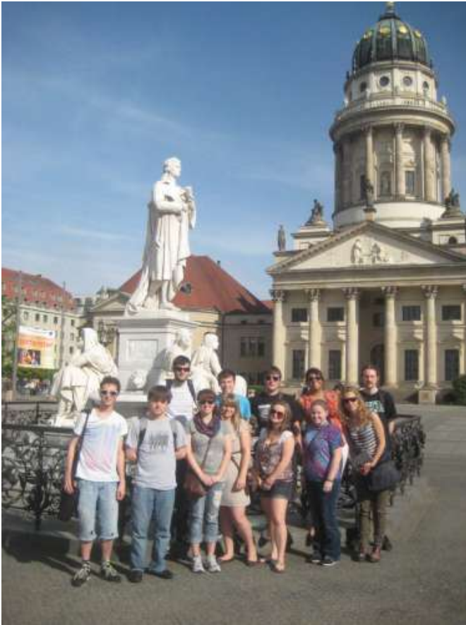
Gendarmenmarkt and the Schiller statue