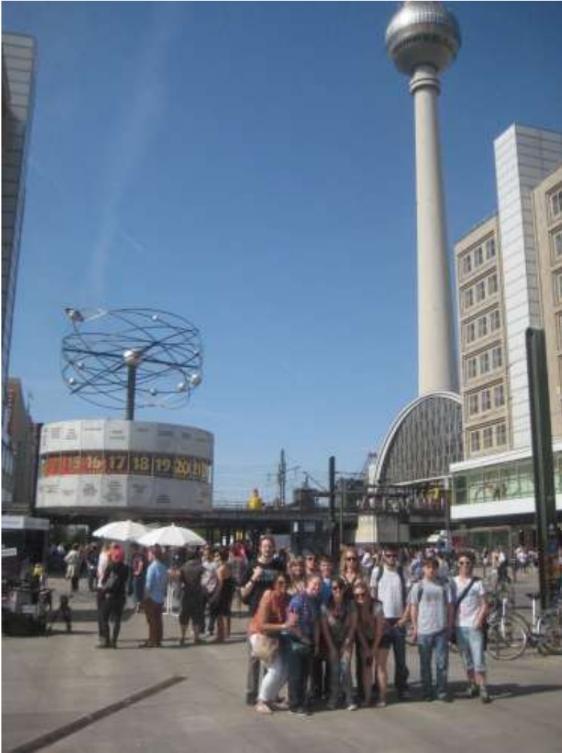
Alexanderplatz with the World Clock and TV-Tower