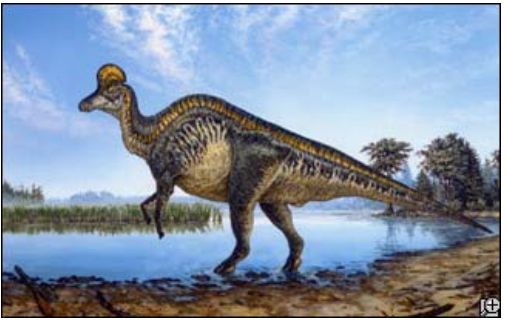
The Crest: Not Just For Show | Video: Discovery Dinosaurs

Oct. 16, 2008 -- <u>Duck-billed dinosaurs'</u> bony head crests, which ranged in appearance from long and pointy to huge, Elvis-style pompadour shapes, likely sounded as unusual as they looked, suggests new evidence.